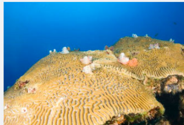
NOVEMBER 29, 2023 - FLORIDA'S CORAL REEF COORDINATION TEAM MEETING