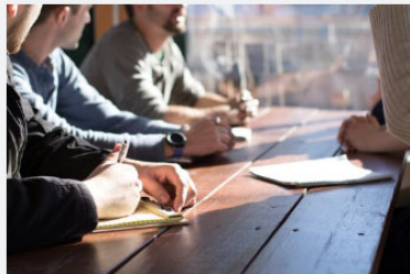
FLORIDA'S CORAL REEF COORDINATION TEAM (FCRCT) MEMBERSHIP AND OPERATING PROCEDURES