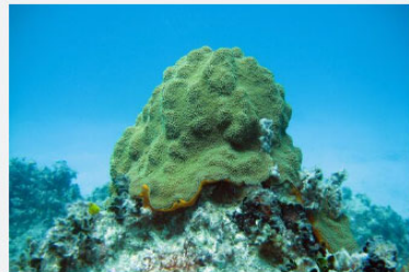
MARCH 22, 2023 - FLORIDA'S CORAL REEF COORDINATION TEAM MEETING