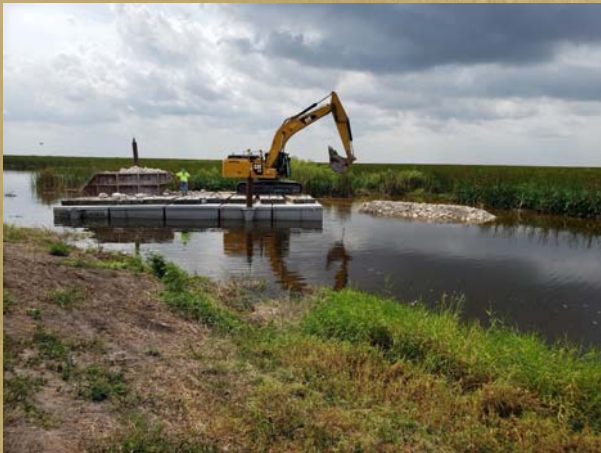
Flow dissipators at all 17 inflow points for STA 3/4