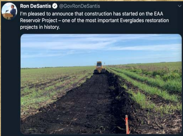
Broke Ground on EAA Reservoir Project STA