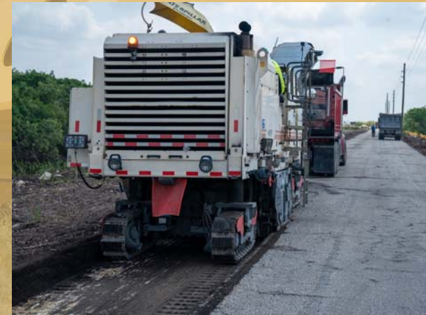
Removing roadbed from Old Tamiami Trail