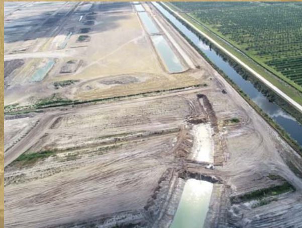
Perimeter canal and embankment foundation installation for Caloosahatchee Reservoir