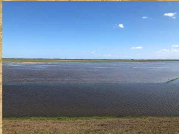
4 of 6 Cells Hydrated at C-44 STA