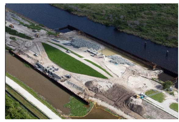
Structure S-278 (C-2) June 2018