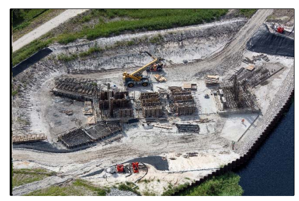
Structure S-293 (IP-3) June 2018