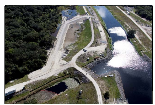
Structure S-291 (IP-3) December 2017