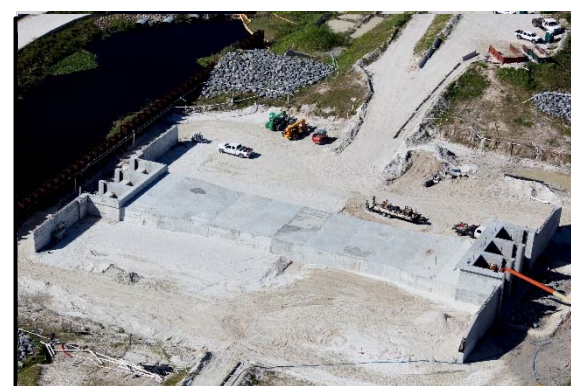
Structure S-278 (C-2) December 2017