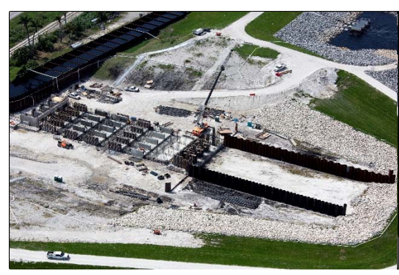
Structure S-271 (C-10A) June 2018