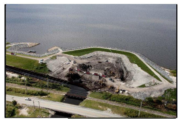
Structure S-271 (C-10A) December 2017