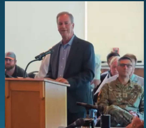
Broward County Vice Mayor Bream Furr