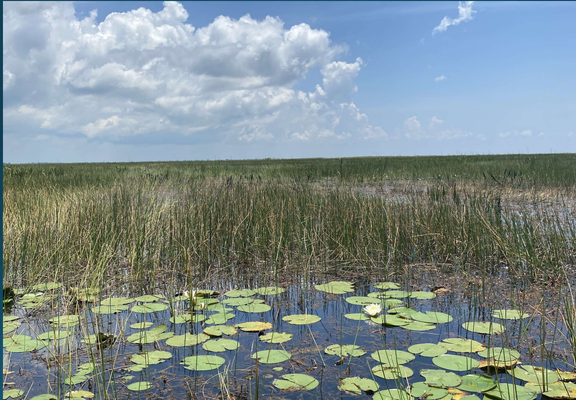
Miccosukee WCA-3A South