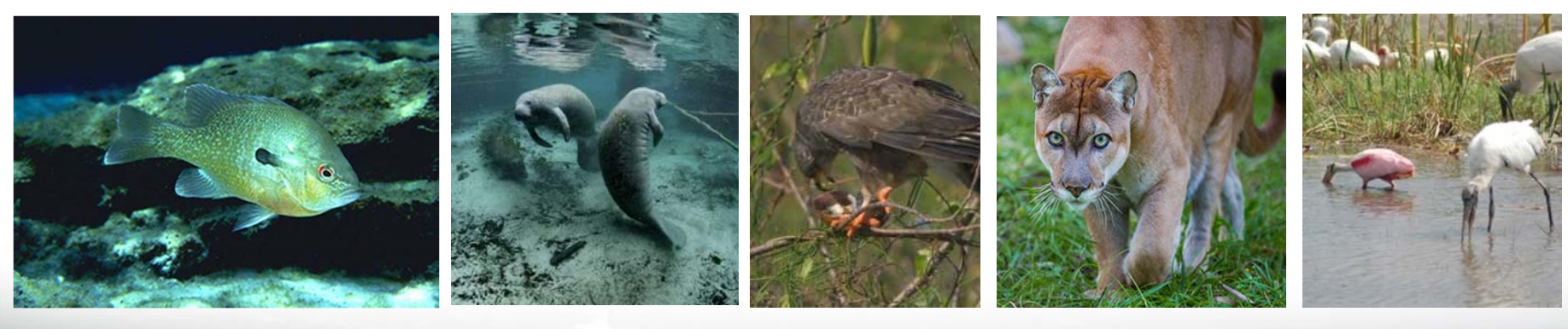
Restores 27,000 acres of wetlands, reconnects an additional 51,000 acres

Restores flows: 91% of target for dry season, 98% for wet season (47% if no project)